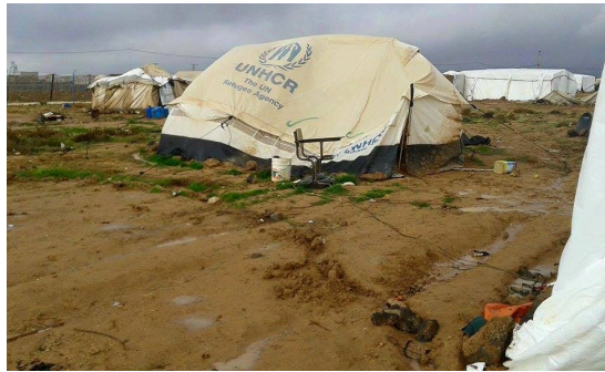
Tented refugee settlement

The small country of Jordan hosts 1.2 million Syrians amongst its own population of 6.6 million. Over 80,000 live in the vast Zaatari camp in northern Jordan. But only 20% of refugees live in such NGO-supported camps, where they are not allowed employment. Most live away from the camps, in urban areas or in makeshift agricultural settlements where there is work but where even the most basic schools are desperately needed.