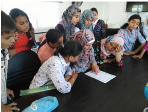
Azraq schoolteacher reading and translating a letter from Brightwell primary school.

The Hope School is in South Amman and caters mainly for Iraqi refugee children. BSR has provided schoolbooks and helped cover the costs of teacher salaries and the rent of the school premises. At the Azraq School , a link has been established with Brightwell primary school involving an exchange of letters and plans for online Skype contacts. We are also providing a large number of schoolbags filled with books, stationery, pencils and rulers, to go to refugee children at all three schools.