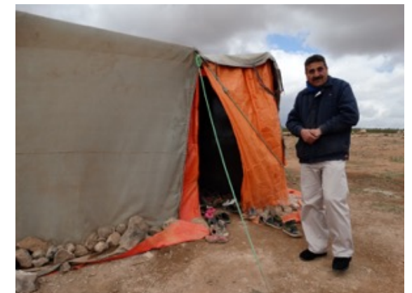
Tented school and teacher funded by HRJ